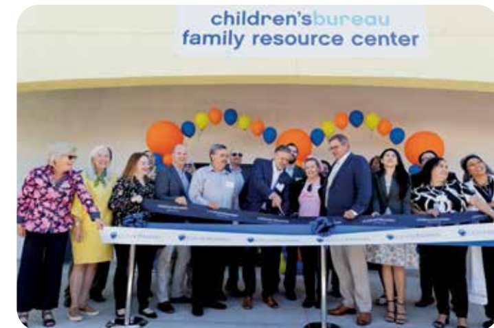
Palmdale Family Resource Center Ribbon Cutting

Watch All For Kids' 120-year journey CLICK HERE