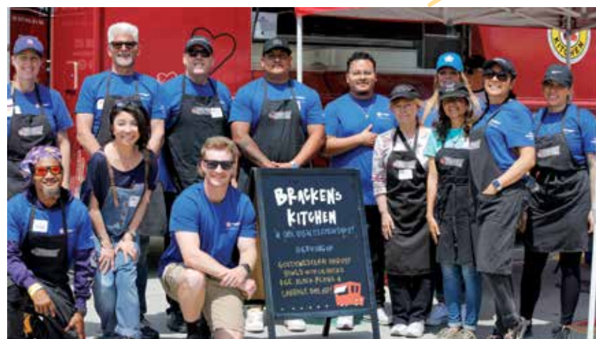
Bracken's Kitchen donating their time and food at Day of the Child Event hosted by Oak View Family Resource Center