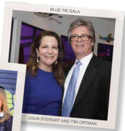
BLUE TIE GALA