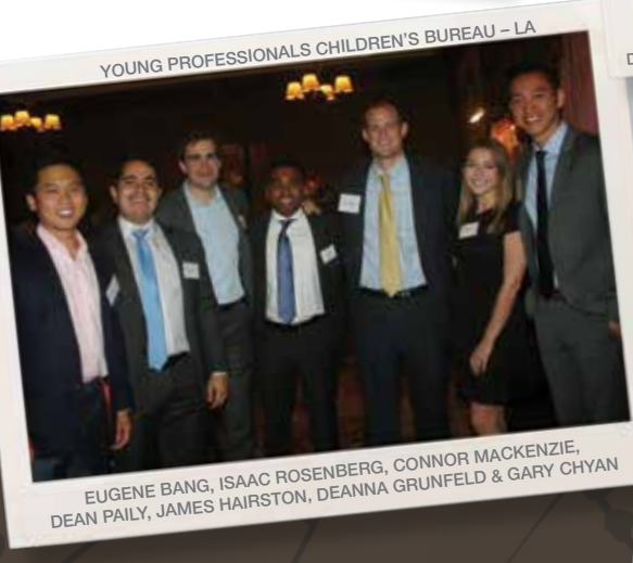
YOUNG PROFESSIONALS CHILDREN'S BUREAU - LA