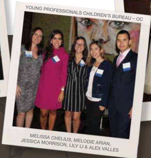
YOUNG PROFESSIONALS CHILDREN'S BUREAU - OC