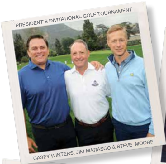
PRESIDENT'S INVITATIONAL GOLF TOURNAMENT

Child abuse can be prevented and more than 200 of you took action by volunteering at Children's Bureau's events, team fundraisers and young professional networks. This year, those activities along with our generous corporate and foundation partners helped us to raise a record $4.2 million in private dollars that directly supported our prevention efforts. Together, you did it and we are honored to have you join us on this journey.