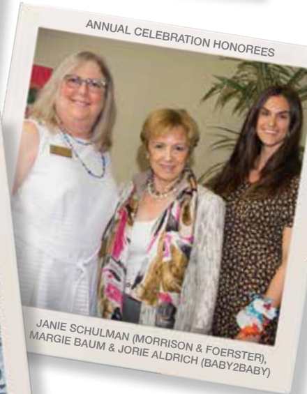
ANNUAL CELEBRATION HONOREES