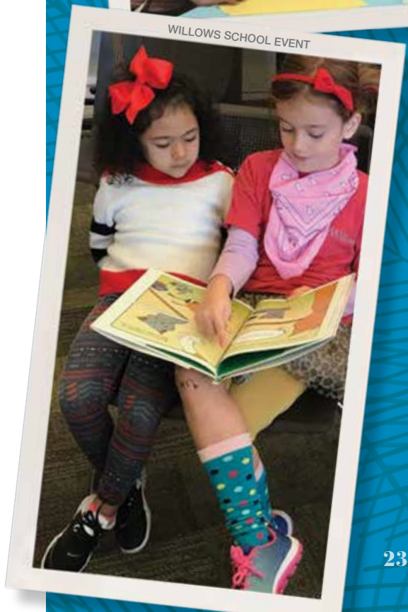
WILLOWS SCHOOL EVENT