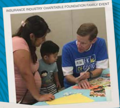
INSURANCE INDUSTRY CHARITABLE FOUNDATION FAMILY EVENT