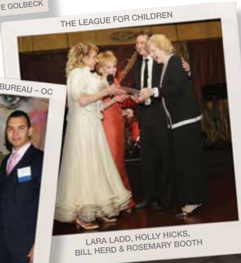
THE LEAGUE FOR CHILDREN