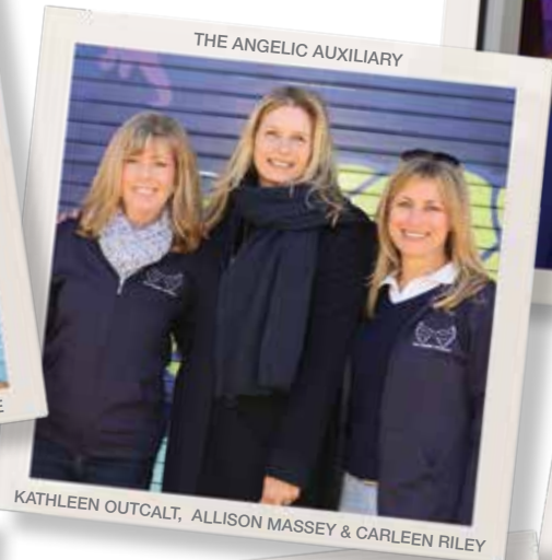
THE ANGELIC AUXILIARY